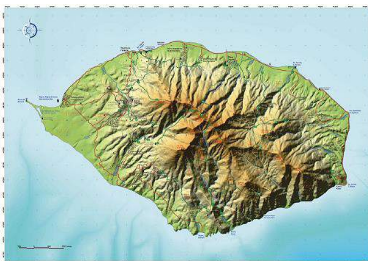
Figure 1: General overview map of Samothraki

The island of Samothraki is located in the north-eastern Aegean Sea (Thraci, Greece). At only 178 km 2 Samothraki is a high mountain massif that dominates the northern Aegean Sea and packs a lot into its small size (Fig. 1). The island is bursting with picture perfect views of pristine cultural landscapes, an impressive geology and varied natural vegetation including ancient oriental plane forests, mountain wilderness, abundant fresh waters in the form of springs and perennial streams with waterfalls which plunge into deep glassy rock pools, hot springs, small coastal wetlands, rocky beaches and a crystal clear sea. Samothraki is a perfect destination for naturalists, thrill-seeking adventurers and dedicated scientists; it seems to attract people who really care for its natural wonders. With a small local population of under 3,000 and a low population density (15 persons/km 2 ), its main economic activities are agriculture, livestock breeding and small scale tourism. The island is relatively undisturbed by the modern world and remains one of the last virgin islands of Greece.