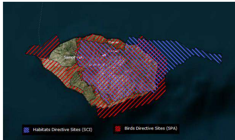
Figure 2: Samothraki's Protected Areas, indicating the two NATURA 2000 sites, covering most of the island, including a large marine area. The red zone indicates the Birds Directive Site (SPA, GR1110012), while the blue area indicates the Habitats Directive Site (SCI, GR1110004).

centre. The Great Gods also known as Kabeiroi were of the Earth and the Underworld, and the cult's mysteries and religious rituals were closely guarded secrets. The ancient ruins of the Sanctuary at "Paliapoli" (old city) are one of the most important archaeological sites in Greece. The Sanctuary's prospered until the 4th Century A.D. when the island came under Byzantine rule and entered into a steep period of decline. From 1204 and until 1457, the island was ruled by the Venetians and then the Genoan family Gattilusi, who constructed a fortress overlooking the town. The Ottoman Empire took over the island in 1457 and held it until the Balkan Wars of 1912, when Samothraki joined Greece.